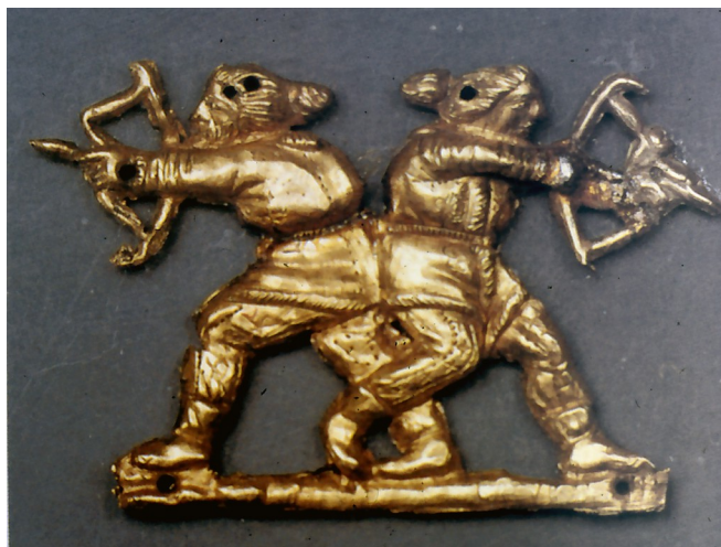
Scythian warriors protecting each other till death, impersonating the lifestyle of Hunor and Magyar. (Embossed golden plate, circa 400 BC, Hermitage, Saint Petersburg, Russia)