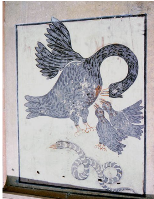
“Pelican” giving life to its nestlings with its blood. The self-devoted behaviour of the love of Christ has its precedent among the Scythian people. (Painting from the coffered ceiling of the reformed church in Terezstenye, 2 nd half of the 18 th century)