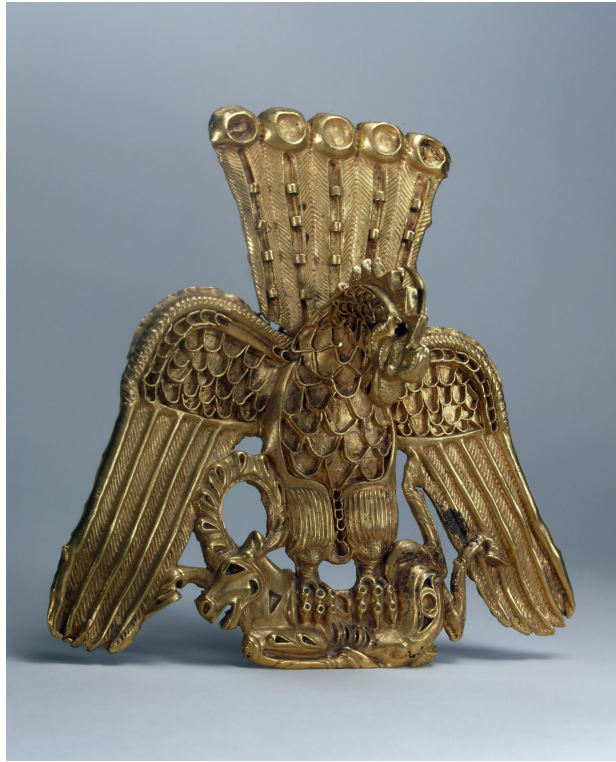
Scythian Turul (falcon) wakening a moribund mountain goat with its own blood. (Embossed golden plate, originally decorated with enamel, pearls and precious stones, circa 400 BC, Hermitage, Saint Petersburg, Russia)