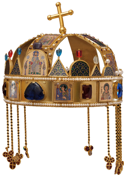
HEAVENLY LIVING TRUTH – The Apostolic and Angelic Hungarian Holy Crown