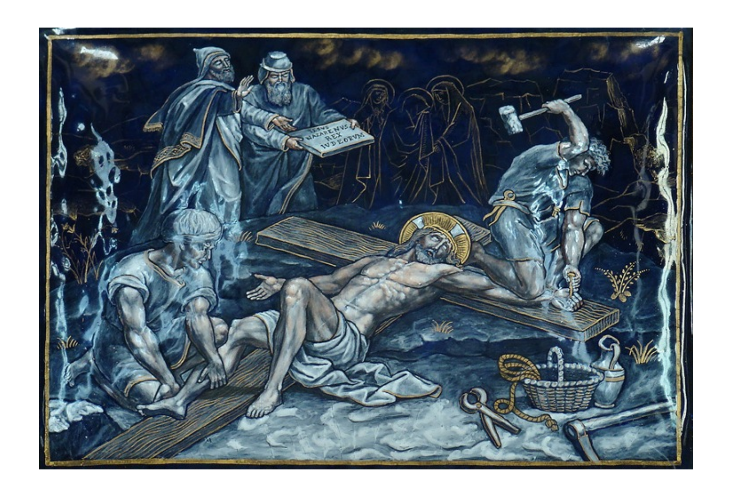
Trianon<sup>10</sup>, 1920 June the 4<sup>th</sup>